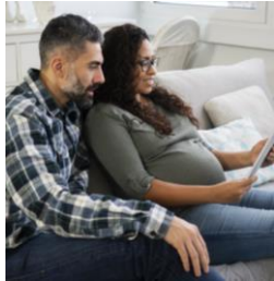
Specialty Care Support Programs