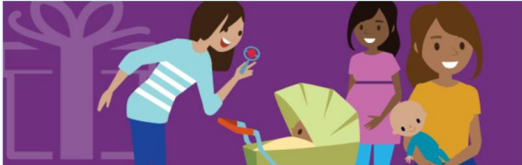
Baby Blocks™ Rewards