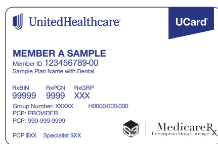
All member information in the sample is fictional for sample purposes.